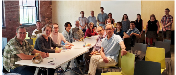
The BCGS in Cambridge