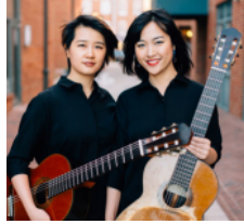
Beijing Guitar Duo